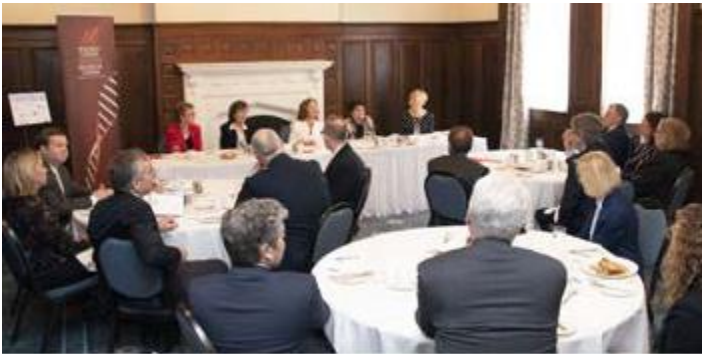
Celebrating the 2020 Gairdner Awards