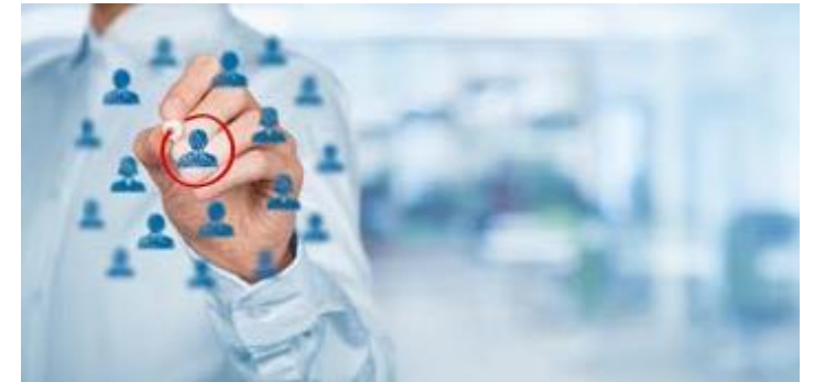
Rare Disease and Orphan Drug Research in Canada