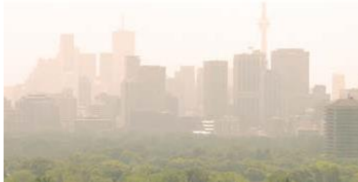
Environmental Health and Climate Change Research in Canada