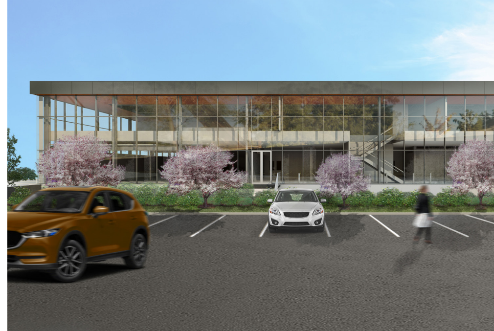
Construction is underway for STEMCELL's new centralized campus, which will feature an Advanced Biologics Manufacturing Facility that includes labs and a global distribution centre, along with extensive office space.

The STEMCELL Technologies team is growing rapidly; in fact, we are on track to bring an additional 3,500 knowledge-based, full time jobs to Canada by 2030 – many of which will be based out of our new campus presently under construction in Burnaby, B.C., funded in part by a partnership with the governments of Canada and British Columbia.